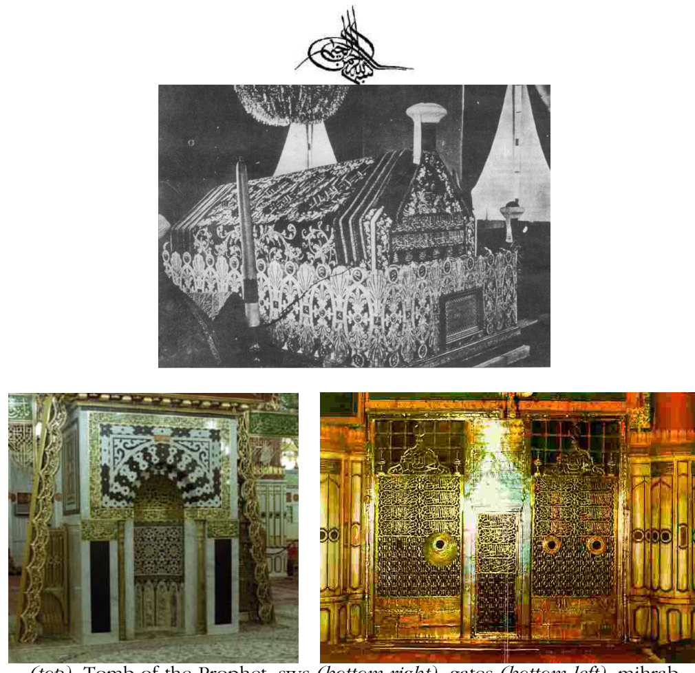
(top), Tomb of the Prophet, sws (bottom right), gates (bottom left), mihrab